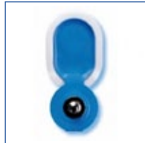
Disposables (e.g. Adhesive electrode)