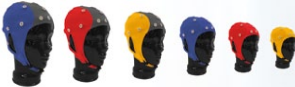
Wave Guard color schemes. From left to right: Large, Medium, Small, Child, Infant, and Baby. Neonatal caps follow a slightly different color scheme.

With WaveGuard you are able to select an appropriate cap for your experiment in a glimpse of an eye. Four distinctive colors were used in different combinations to allow a straight-forward selection of a cap. The cap size is also indicated on the label.