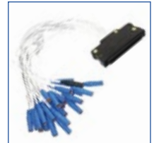
Cable connections (e.g. Adapter for shielded caps)

CE The WaveGuard EEG caps and accessories are approved for routine clinical use: CE class I (Europe), FDA 510(k) K110223 (USA)