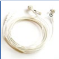
Broad range of electrodes (e.g. Ear electrodes)

A variety of accessories is available for the WaveGuard caps.