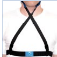
Options for cap fastening (e.g. Chest belt)